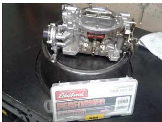
EDELBROCK "PERFORMER" CARBURATOR 1411 - 750 CFM ELECTRIC CHOKE METERING ROD KIT INCLUDED $100.00