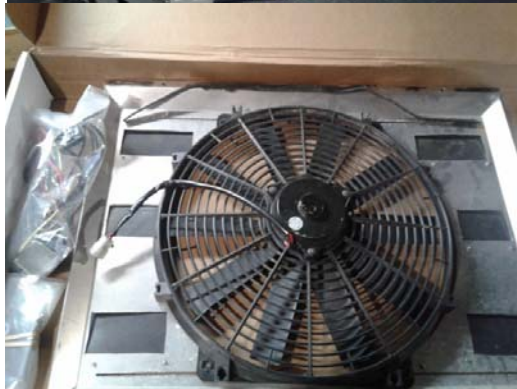
SINGLE FAN RADTIATOR FAN (OFF 1968 PONTIAC 400 C.I.)